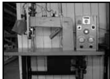
PFAFF Goretex Tape/Heat Sealer 901-8304-122