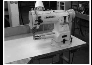
Brother Freearm Sewing Machine, Model LS3-C51-050