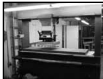
Atom G59HS Hyd. Moveable Head Die Press, 5' Span