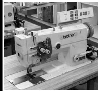
Brother Double Needle Sewing Machine – 1/4", Model LT2-B875-907