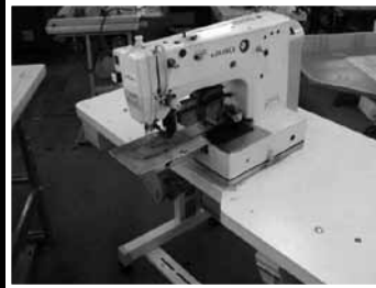
Juki Single Needle Specialty Machine, Model AMS-206C