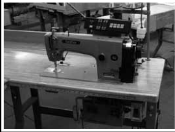
Brother Single Needle Sewing Machine, Model DB2-B791-403