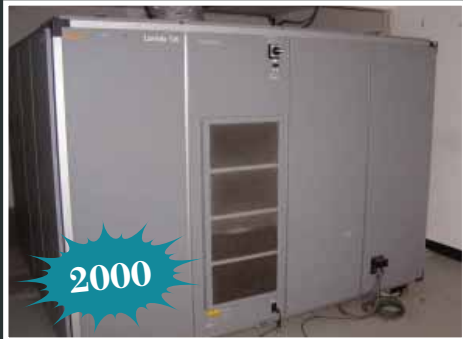
Lambda 130 Laser Printer