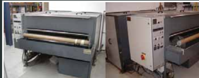
Autopan 130 Photo Paper Processor