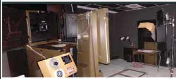
Holex Copycamera with Digital Scanner