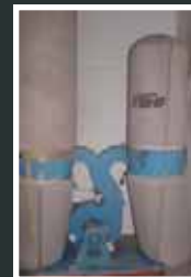
Shen Kyng UFB 102B Dual Bag Dust Collector