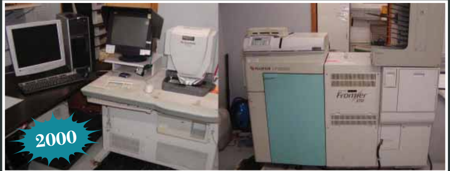
2000 Fuji Film Frontier Digital 370 Minilab System, Model LP2000SC Digital Printer Processor, Model SP2000 Scanner and Autodensitometer, S/N 2925325