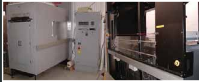
Refrema Olympic E-6 Film Processor