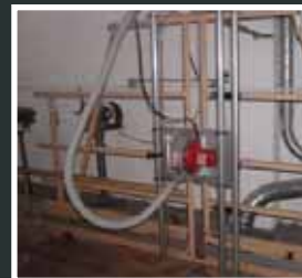
Safety Speed Cut H4 48" Panel Saw