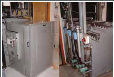
Refrema Black and White 140 Compact Film Processor