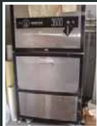
Fox Pollution Packer 3600 Trash Compactor