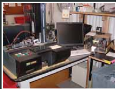
Byers Slide Mounters and Sery Imprinters