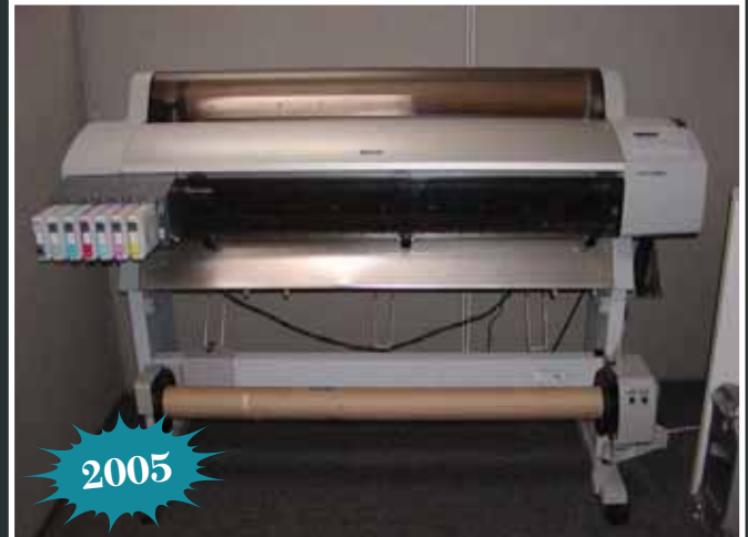
Epson Stylus Pro 9600 Color Ink Jet Printer

Auction: Wednesday, August 20, at 10:00 a.m.