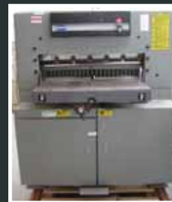
Challenge 305MC 30.5" Paper Cutter