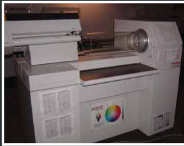
Heidelberg Drum Scanner