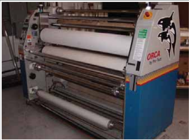
Orca III 60" Hot and Cold Laminator