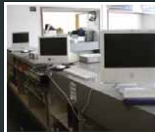
Mac G5 Computers