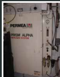
Permea Nitrogen Generator Model CPAY C89151