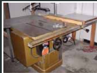
Powermatic Mod 66 10" Table Saw 28" x 38" Table with Biesemyer Fence