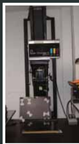
Omega Chromega D 4 x 5 Enlarger