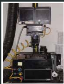
Maron Mod. 600 Dupe Camera