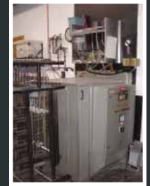
Refrema Color Compact 140 C-41 Film Processor