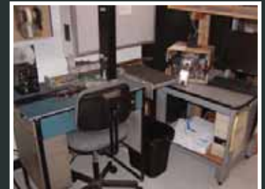
Byers Auto 5 Heat Cardboard Mounter and Sery Imprinter