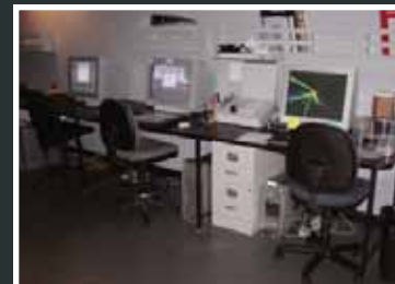
Mac Prep Stations