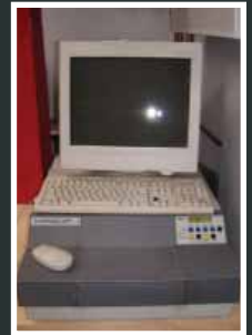
Solitair 35mm Film Recorder