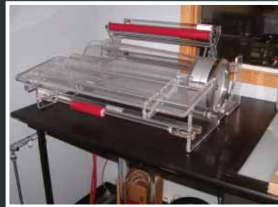
Drum Scanner Prep Station