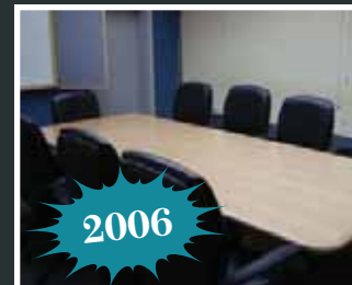
2006 10' x 4' Maple Conference Table with 10 Leather Chairs

Safety Speed Cut Mod. H-4, Panel Saw with Milwaukee 2 1/2 HP Saw, S/N L-84