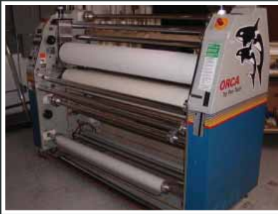
Orca III 60" Hot and Cold Laminator