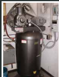
(2) Dayton 5 HP Compressors