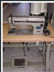
Sunstar Single Needle Sewing Machine 110V